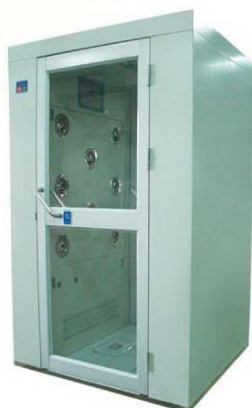
▼ 標準型 /Standard