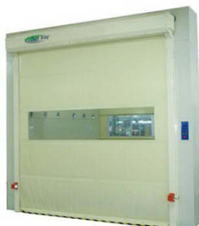
▼ 快速捲門型 /Fast rolling up door type