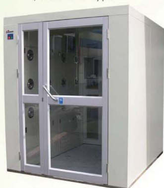
▼ 雙門片型 /Dual door type